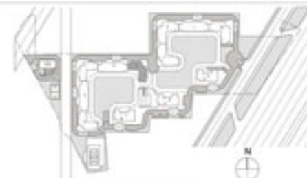
1 KEY PLAN