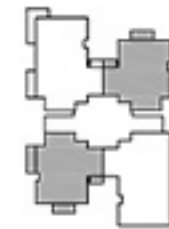
TOWER A2 (0L) CLUSTER PLAN SCALE 1:1000