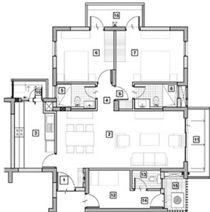
2B+2T+SR- TYPE A