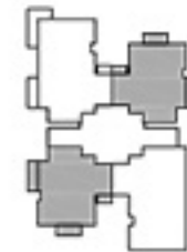
TOWER A3 (0L) CLUSTER PLAN SCALE 1:1000